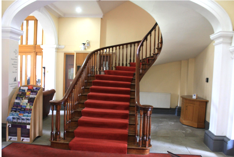
Stairway to President's Corridor

Access to these areas is restricted to Commercial Customers only