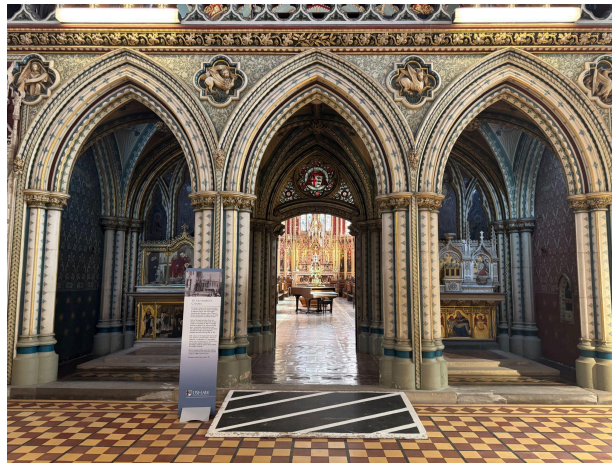
Ramp Entrance to St Cuthbert's Chapel