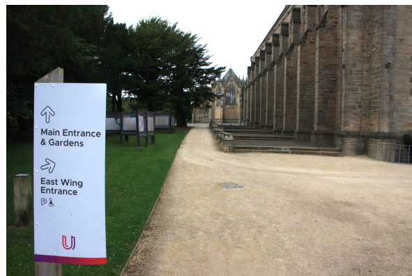
Pathway to Main House from Visitor Centre (slight incline)