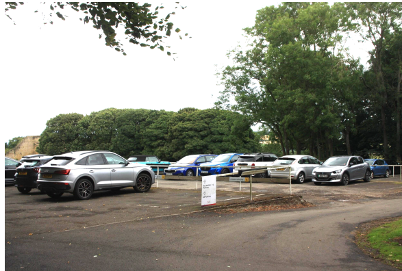
Visitor Centre Car Park