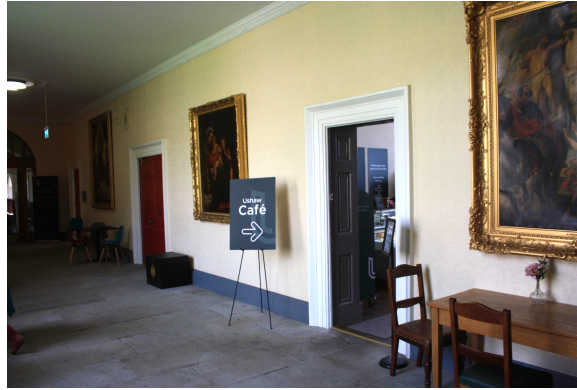
Cafe Entrance (photo shows average corridor width)