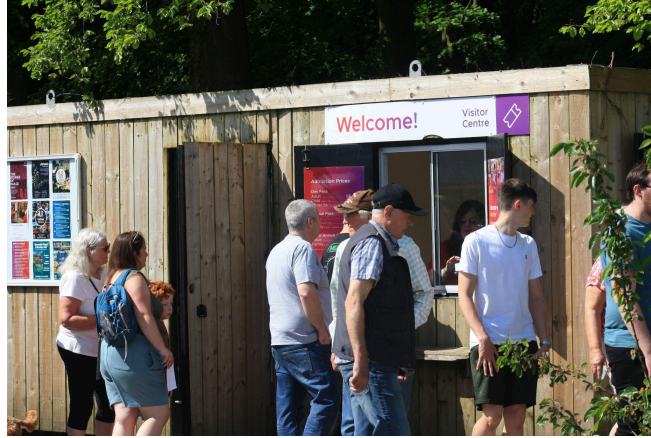
Ushaw Visitor Centre